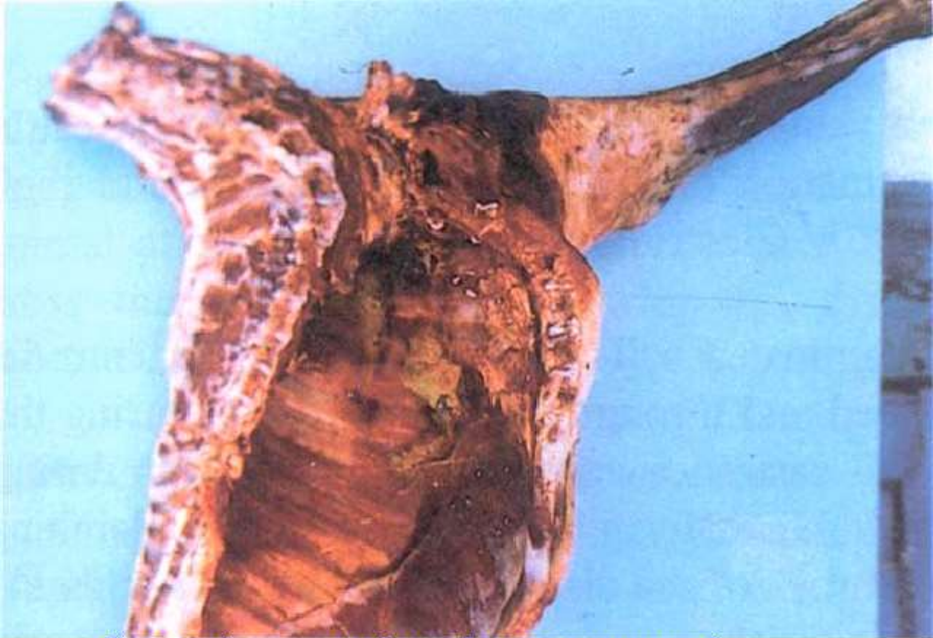
Contagious caprine pleuropneumonia fibrinous inflammation of the pleura